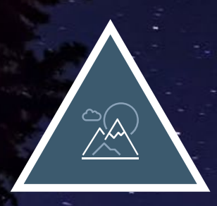
Provide Outdoor Adventure Education to Youth

We enable youth in Canada to get away from their daily lives, creating space in nature to engage in self-discovery and experiential learning. Expert instructors lead participants through novel, real-life experiences that require groups to collaboratively problem solve through challenge, failure, and success.