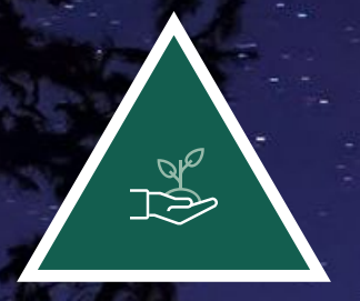
Employ A Curriculum Promoting Personal Growth

We enable youth in Canada to get away from their daily lives, creating space in nature to engage in self-discovery and experiential learning. Expert instructors lead participants through novel, real-life experiences that require groups to collaboratively problem solve through challenge, failure, and success.